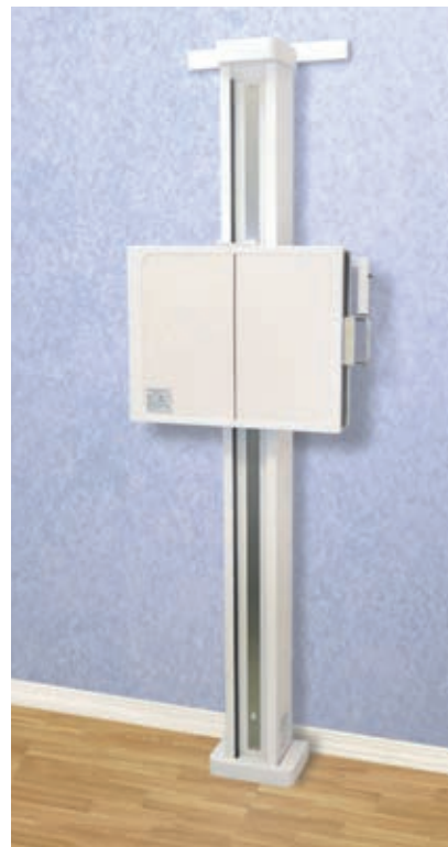
Lowers to Perform Standing Knees