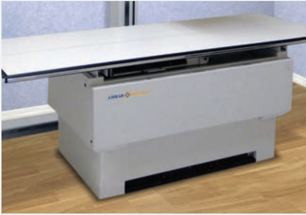
Elevating Table, 400 lb Patient Capacity