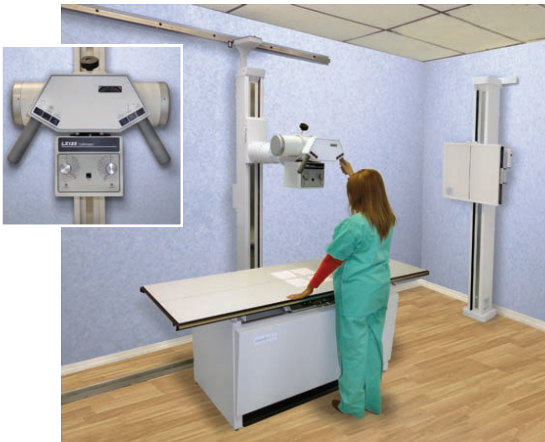
Perform all exam types to include cross table laterals