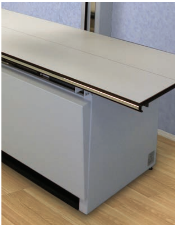
Completely Flat Table Top