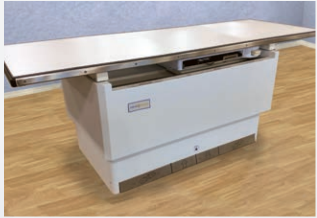
Elevating Table, 650 lb Patient Capacity