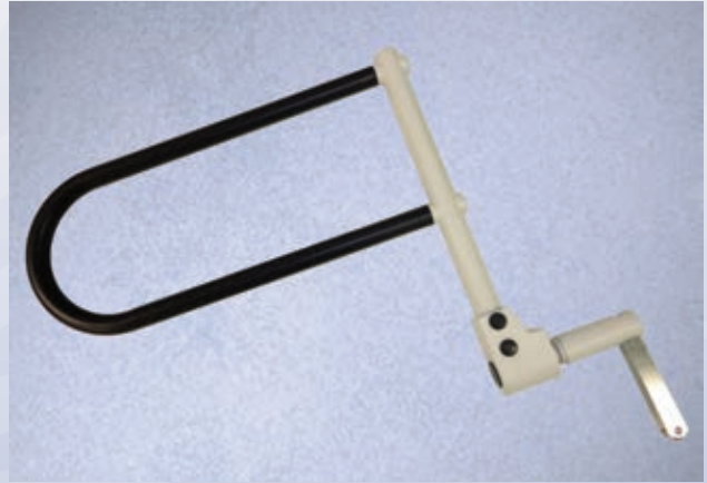
Overhead Grip for the J1000 Wallstand