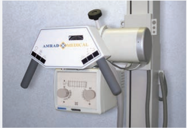
Economical Alternative FMT