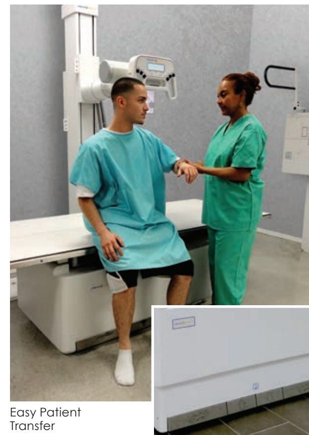
Easy Patient Transfer