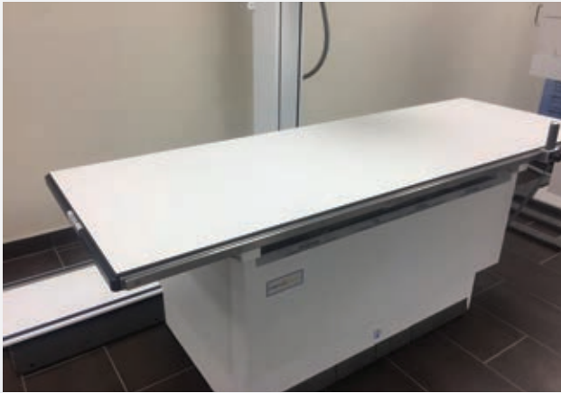
35.5" Wide Table Top