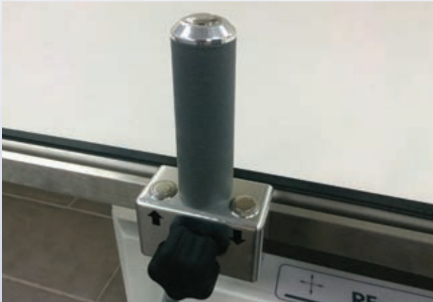
Table Lock Release Handle with Elevation