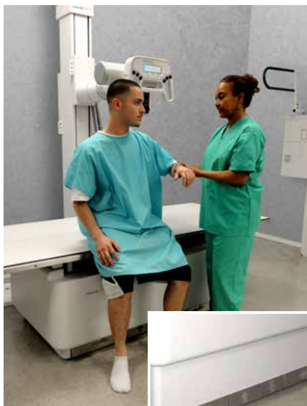
Easy Patient Transfer