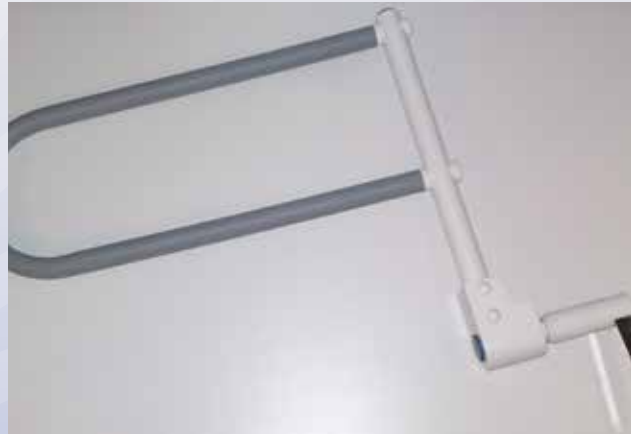
Overhead Grip for J1000 Wallstand