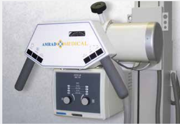
Economical Alternative FMT