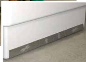
Convenient Lock-Release Pedals