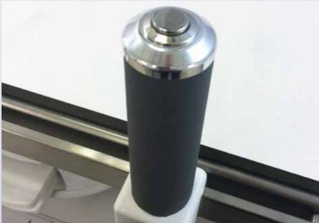
Table Lock Release Handle