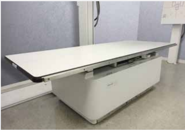
35.5" Wide Table Top